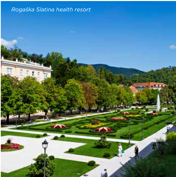
Rogaška Slatina health resort